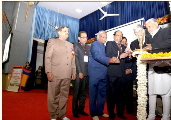
Inauguration of Indian Society of Agricultural Engineers Convention 2018 by Shri Parsottam Rupala, Hon. Minister of State for Agriculture, Gol & dignitaries at AAU, Anand

The theme session on 'Doubling Farmers' Income through Technological Interventions' was chaired by Shri Sanjay