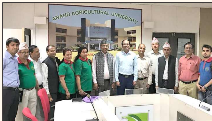
Visit of Nepal Cooperative dairies delegation to AAU