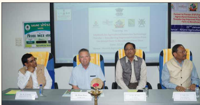
Farmers to Farmers Training Programme at AAU, Anand

AAU, Anand; NCCSD, Gandhinagar; Florida Agricultural and Mechanical University (FAMU), USA and ATMA jointly